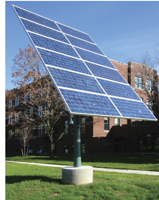
Felician Sisters Convent and Our Lady of the Sacred Heart High School Photo courtesy of Perkins Eastman

The Collaborative for High Performance Schools ( www.chps.net ) provides guidelines for high performance school buildings across the following criteria: sustainable sites, water, energy, materials, indoor environmental quality and policy, and operations. The United States Environmental Protection Agency also provides resources for healthy school environments (< http://cfpub.epa.gov/schools/index.cfm >).